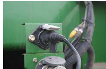
Mounted trailer coupler