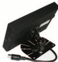
Contourable Mount included