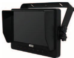
U-bracket & Sun Visor included