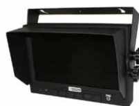
VT7HD 7" (waterproof version available)