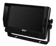
VT9HDQ 9" Quad